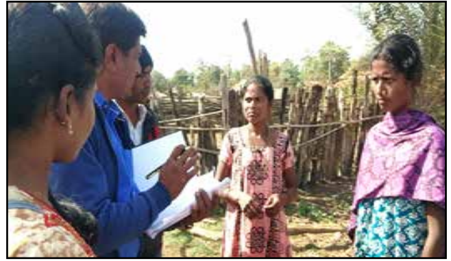
Women under threat

The IHRC team also visited other parts of naxal killings namely Kosmi, identified the victims, relatives of the deceased and got direct and clear views and their reactions.