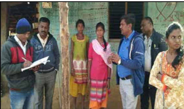
Villagers under trauma of Naxal attacks speak to IHRC team.