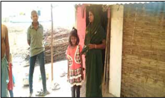
Relatives of the deceased