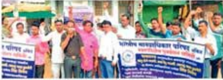
डिहल शरीर वीरान नक्षलवाद्यांचा निषेध करताना भारतीय मानवाधिकार परिषद या संदर्भाचे सदस्य.