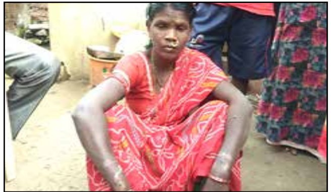
Victim of Naxal atrocity. Injuries visible on her hands.