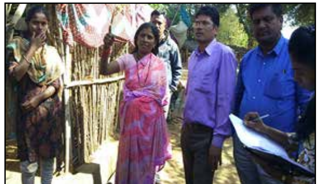
Agitative response against naxal killings

The victims and relatives of the deceased voluntarily provided their details and photographs with folded hands and requested the IHRC team members to take up their grief to the government and provide them protection and life with dignity.