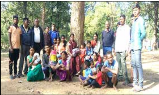
Villagers with IHRC team