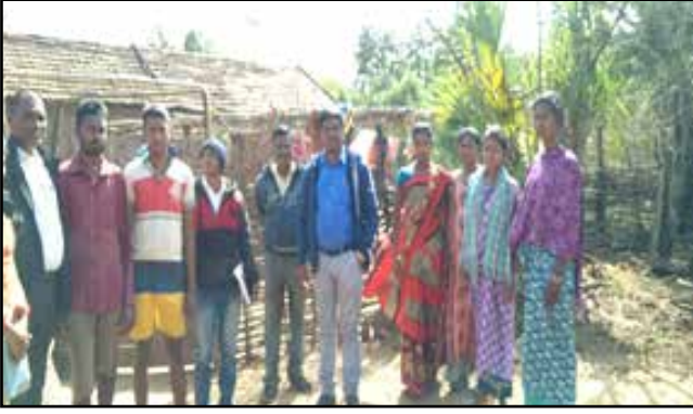
IHRC team with villagers.