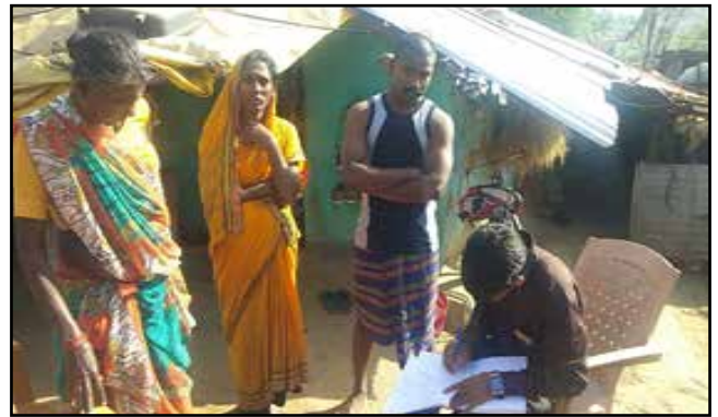
Interviewing the victims