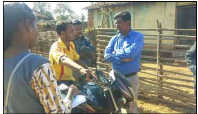
Young ones responded on the go