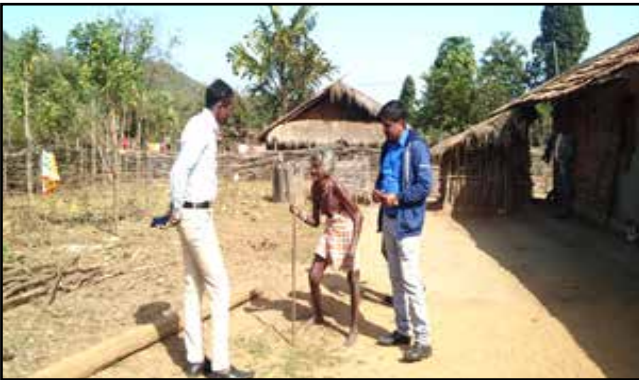
Rural and Urban Naxals responsible for depriving the population from developments and right to life with dignity.