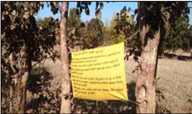
Anti Naxal banners in the rural area