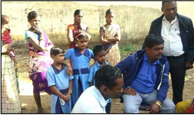
Participation by Women and Children