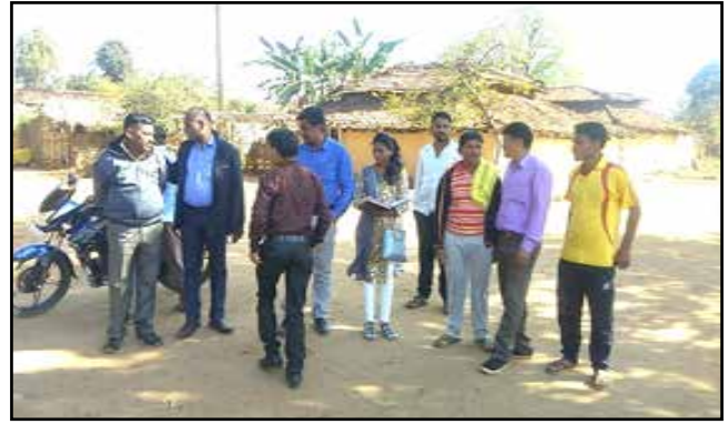
IHRC team with villagers.