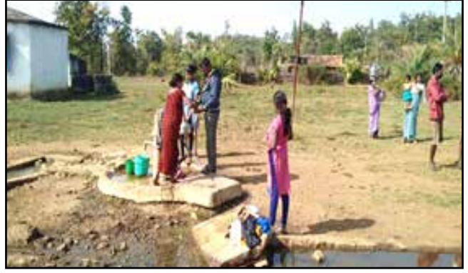
IHRC tea approached the villagers in open public places.