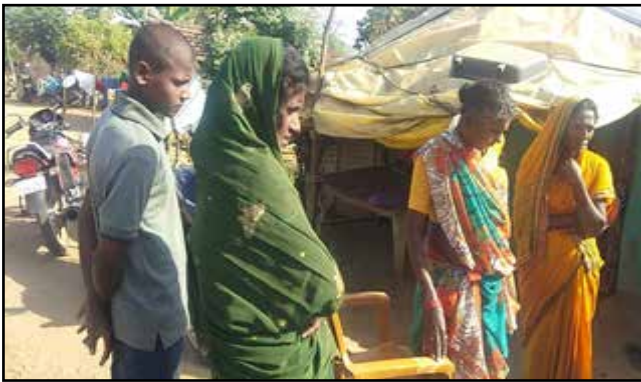
Family membes of deceased