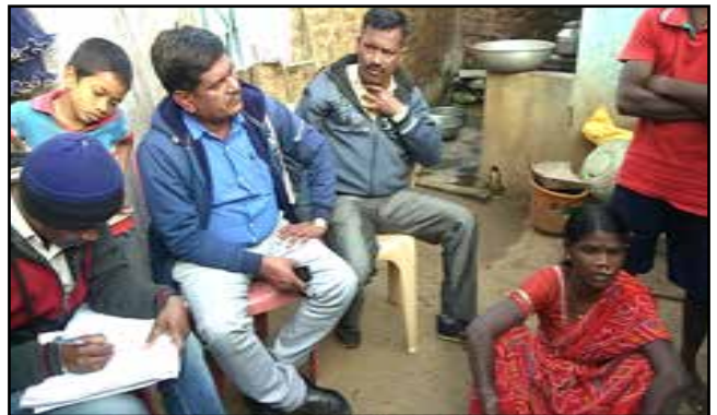
Victim explaining the terror story of abduction torture by Naxal.