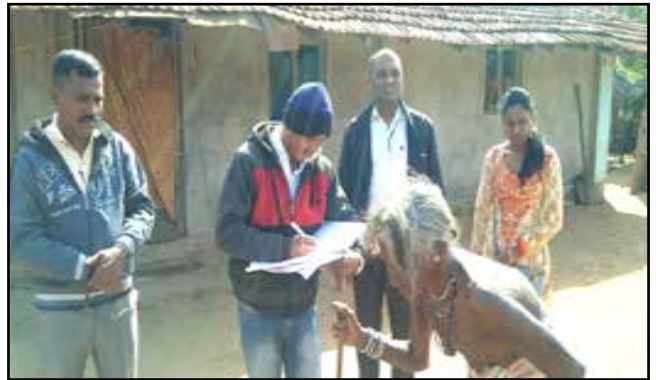
Poor population away from the basic human needs